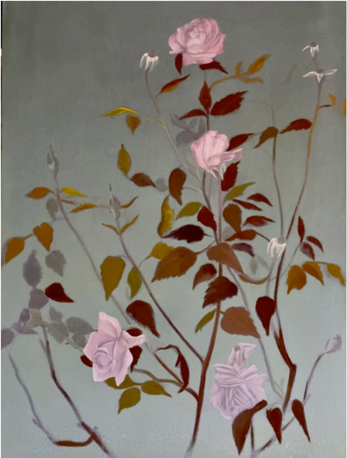
Vasilis Zografos Untitled, 2023 Huile sur toile 80 x 60 cm