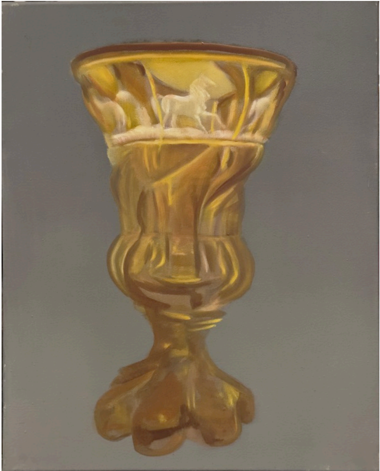
Vasilis Zografos Untitled, 2023 Huile sur toile 50 x 40 cm