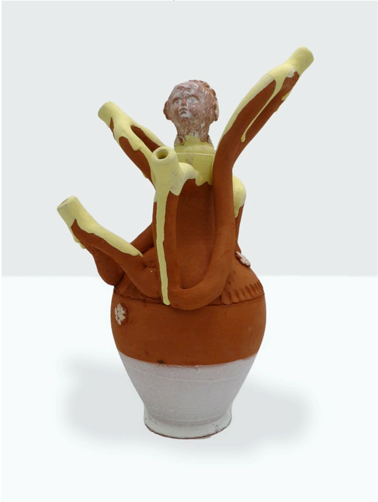
Vasilis Zografos Untitled, 2022 Clay 25 x 18 x 15cm