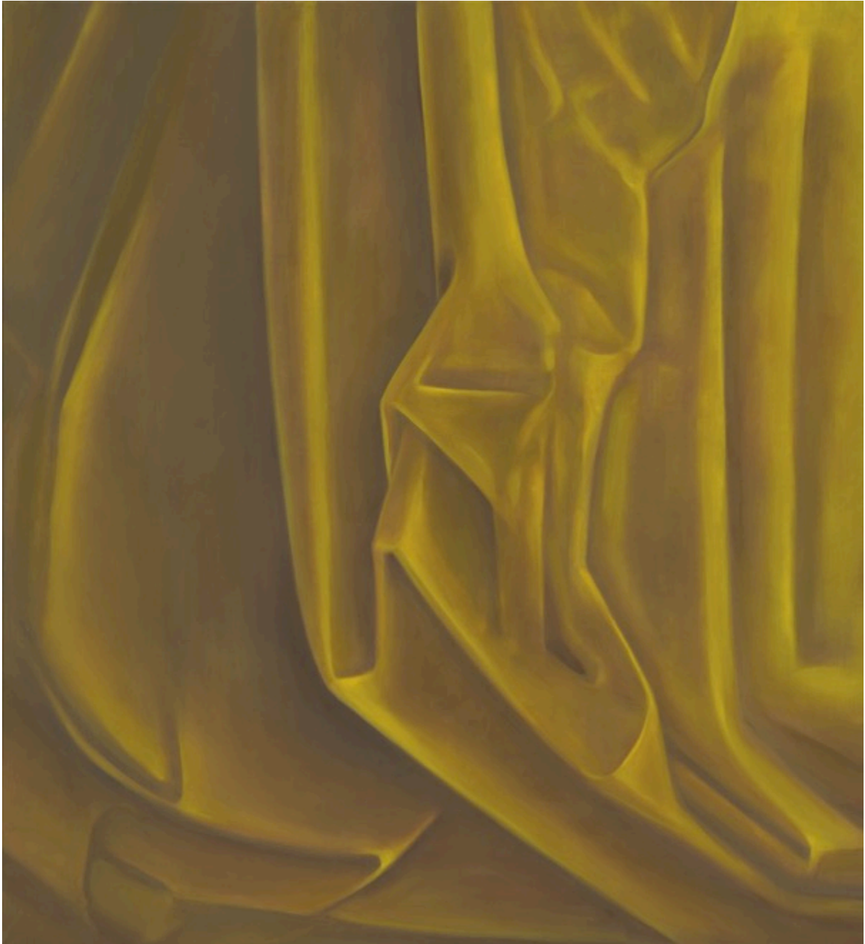
Vasilis Zografos Untitled, 2023 Huile sur toile 130x120cm