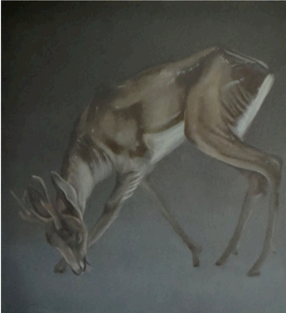
Vasilis Zografos Untitled, 2023 Huile sur toile 120 x 110 cm