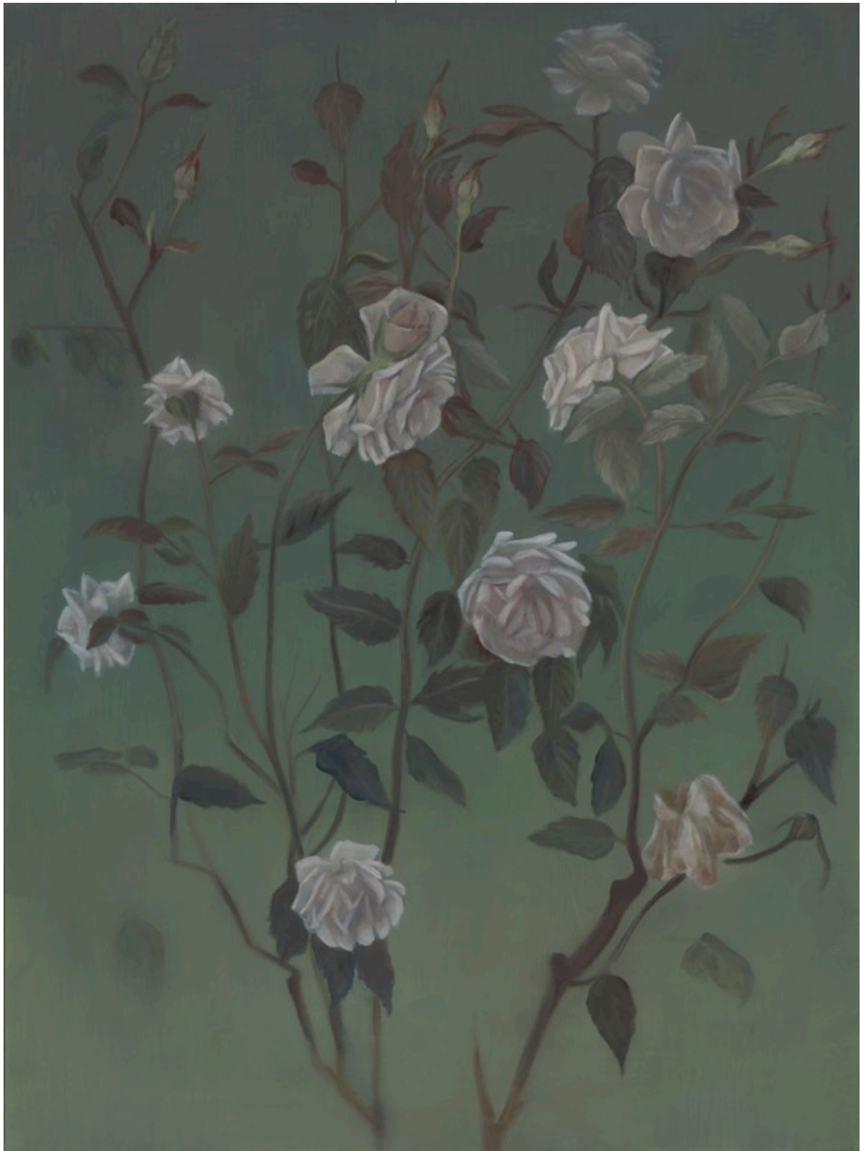
Vasilis Zografos Untitled, 2023 Huile sur toile 80 x 60 cm