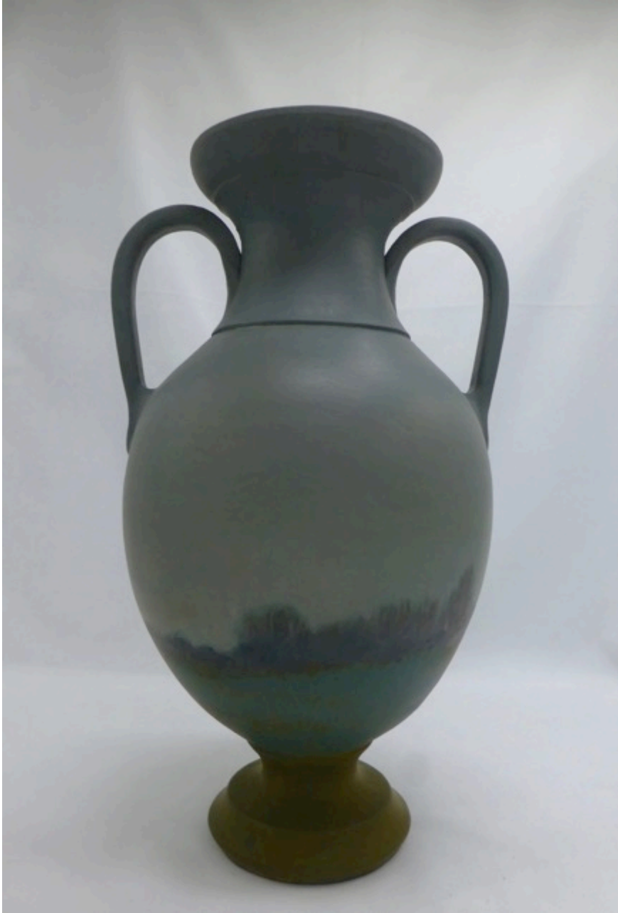
Vasilis Zografos Untitled, 2022 Stoneware and oil paint