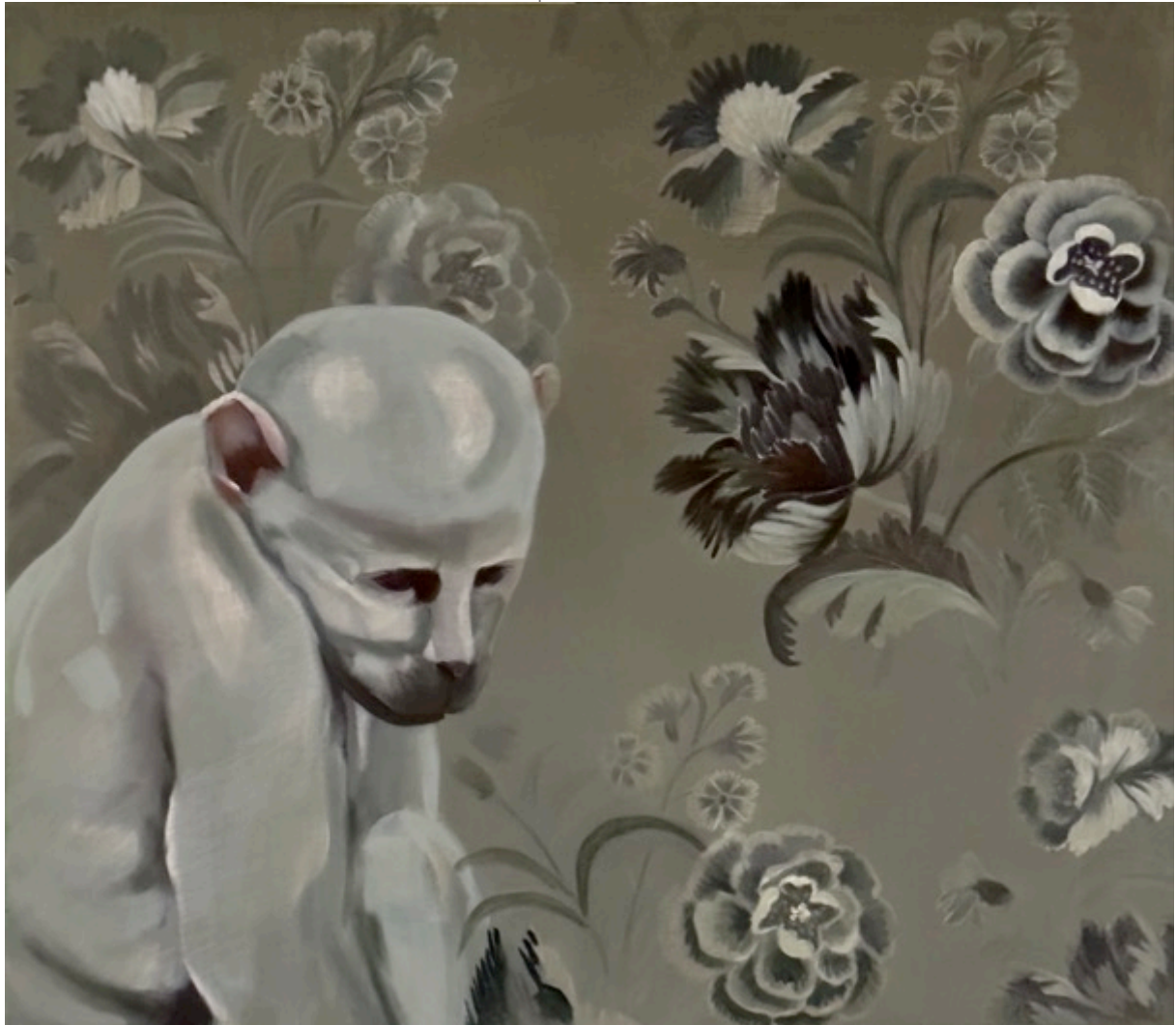
Vasilis Zografos Untitled, 2023 Huile sur toile 70 x 80 cm