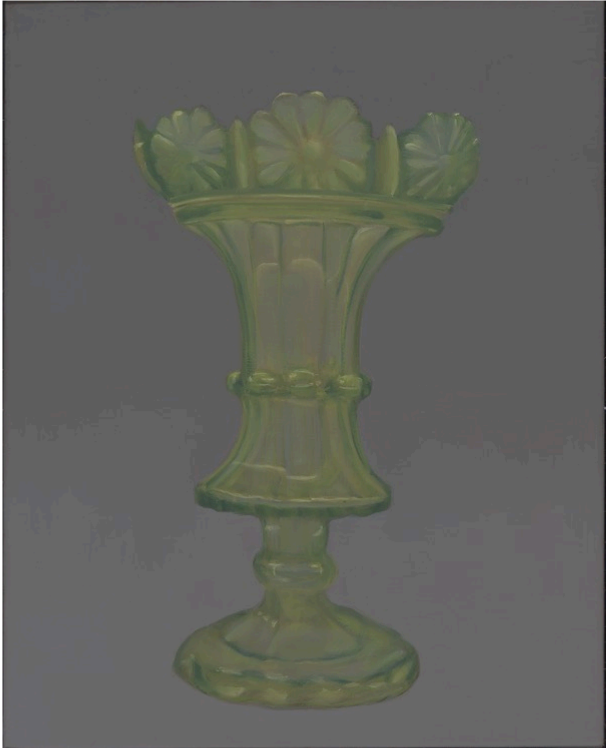
Vasilis Zografos Untitled, 2023 Huile sur toile 50 x 40 cm