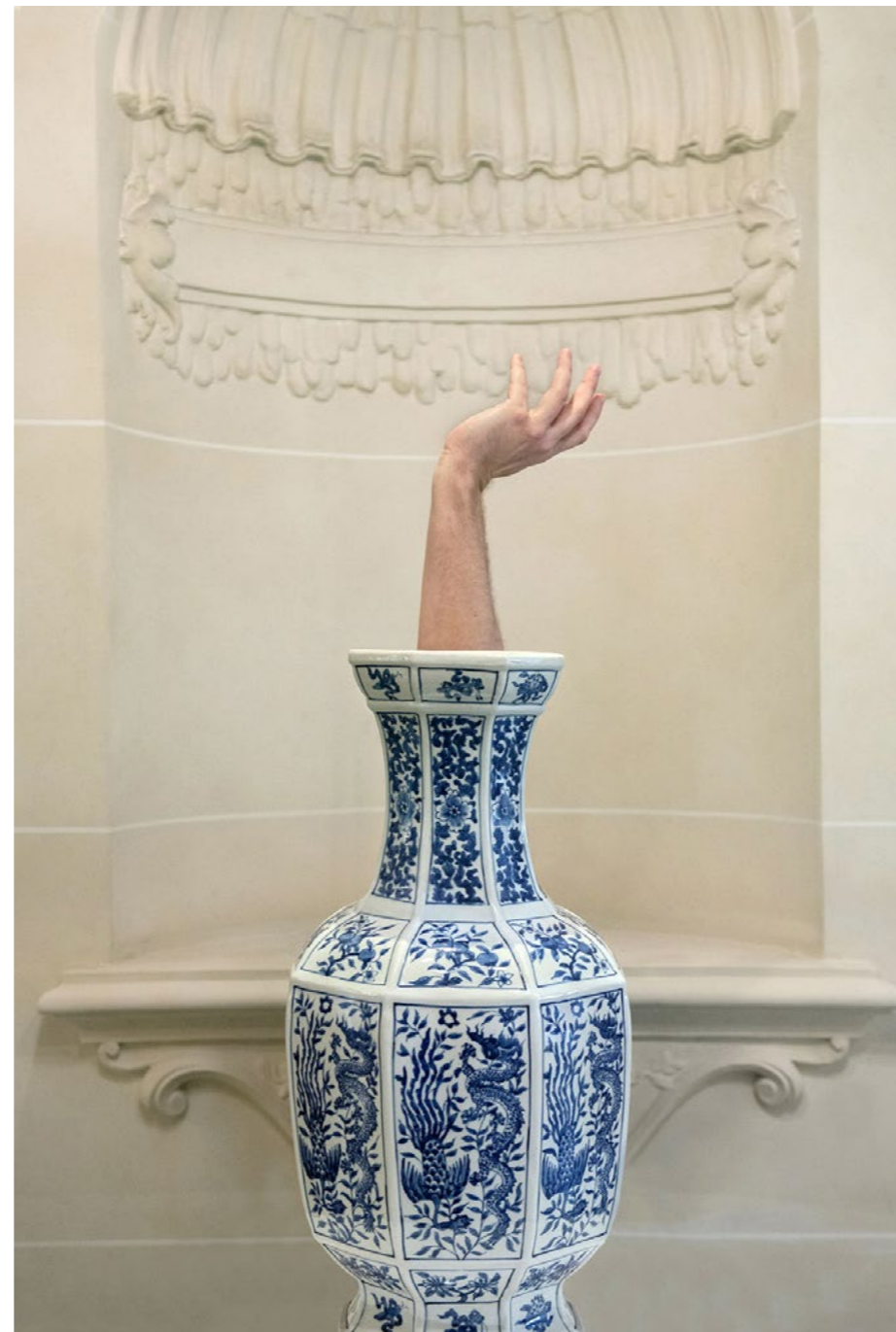
Vase de Chine en porcelaine à décor bleu et blanc de dragons parmi fleurs et feuillages, Julien. Hôtel Hermitage Monte-Carlo. 2025

29,7 x 21 cm - Unique pieces Drawing, colored pencil on matte paper | Photograph printed on Canson paper, colored pencil.