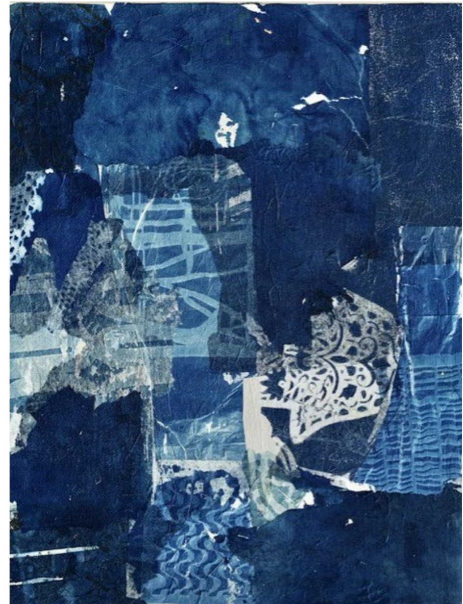
INDIGO TRIPTYCH 3

40 x 50 cm 5 + 2 AP Tirage photo sous plexi mat