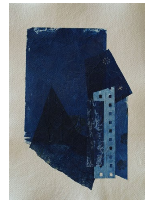
CYAN 2, 3 & 4

30 x 21 cm Unique pieces Photo collage in cyanotype on rag paper