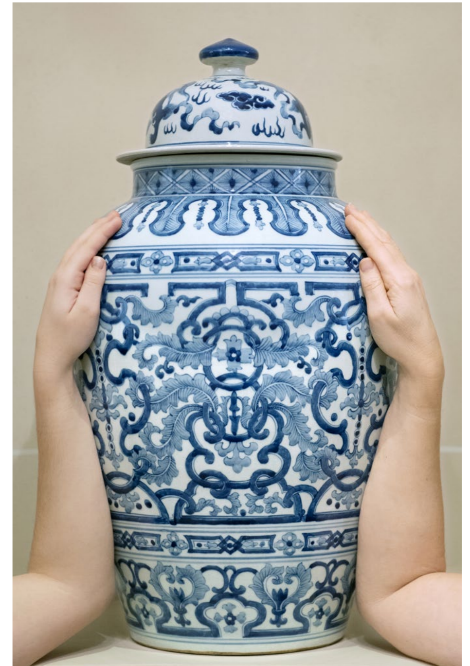
Vase de Chine en porcelaine à décor bleu et blanc avec des motifs géométriques et floraux, Léane, Laetitia. Hôtel Hermitage Monte- Carlo. 2025

70 x 50 cm - Edition of 5 Inkjet print, Hahnemühle 260 gsm satin photo paper mounted on Dibond, white wooden frame, museum-quality glass.