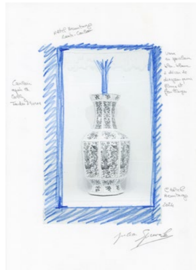
Etudes préparatoires. Hôtel Hermitage Monte-Carlo. 2025

29,7 x 21 cm - Unique pieces Drawing, colored pencil on matte paper | Photograph printed on Canson paper, colored pencil.