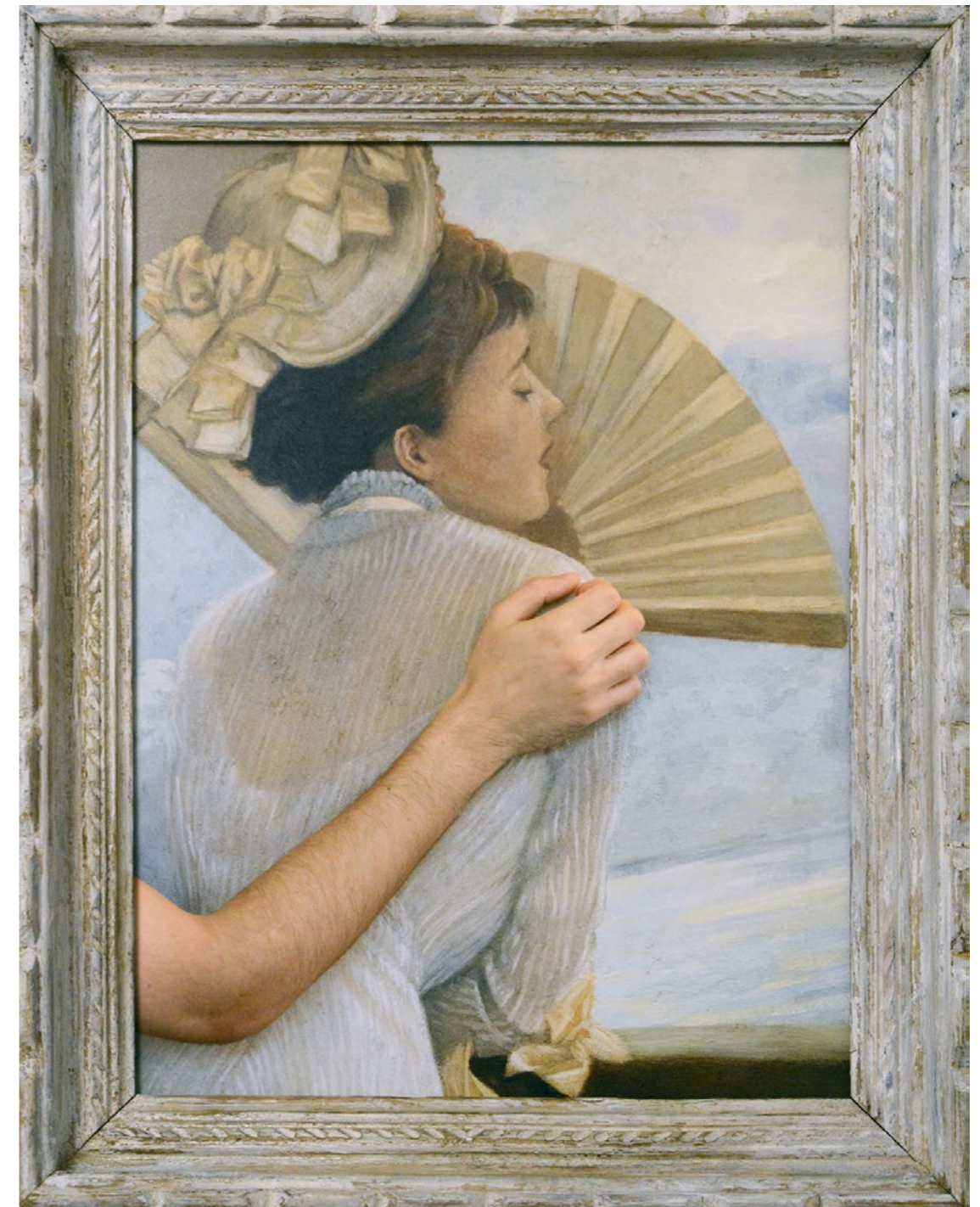
La galerie du HMS Calcutta (Portsmouth) de James Tissot, vers 1876, reproduction du tableau de la Tate Collection à Londres (détail), Jean-Baptiste. Hôtel Hermitage Monte-Carlo. 2025