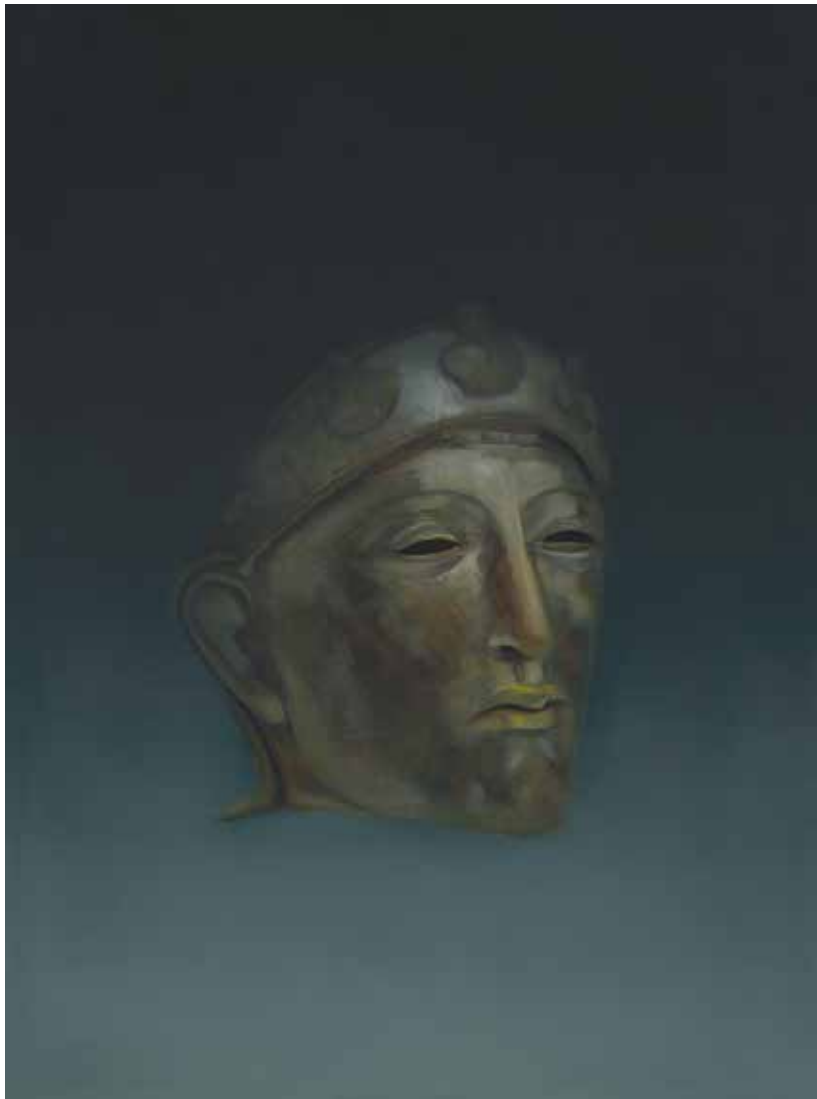
Vasilis Zografos Untitled, 2017 huile sur toile 80 x 60 cm