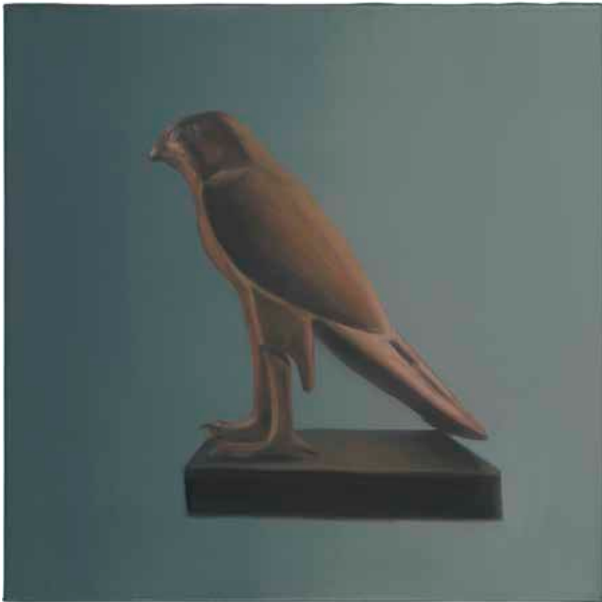
Vasilis Zografos Untitled, 2013 huile sur toile 35 x 35 cm