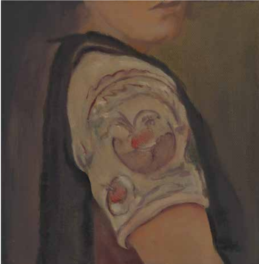
Vasilis Zografos Untitled, 2015 huile sur toile 20 x 20 cm