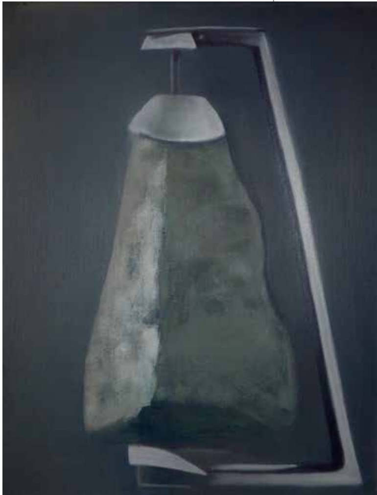
Vasilis Zografos Untitled, 2017 huile sur toile 45 x 35 cm