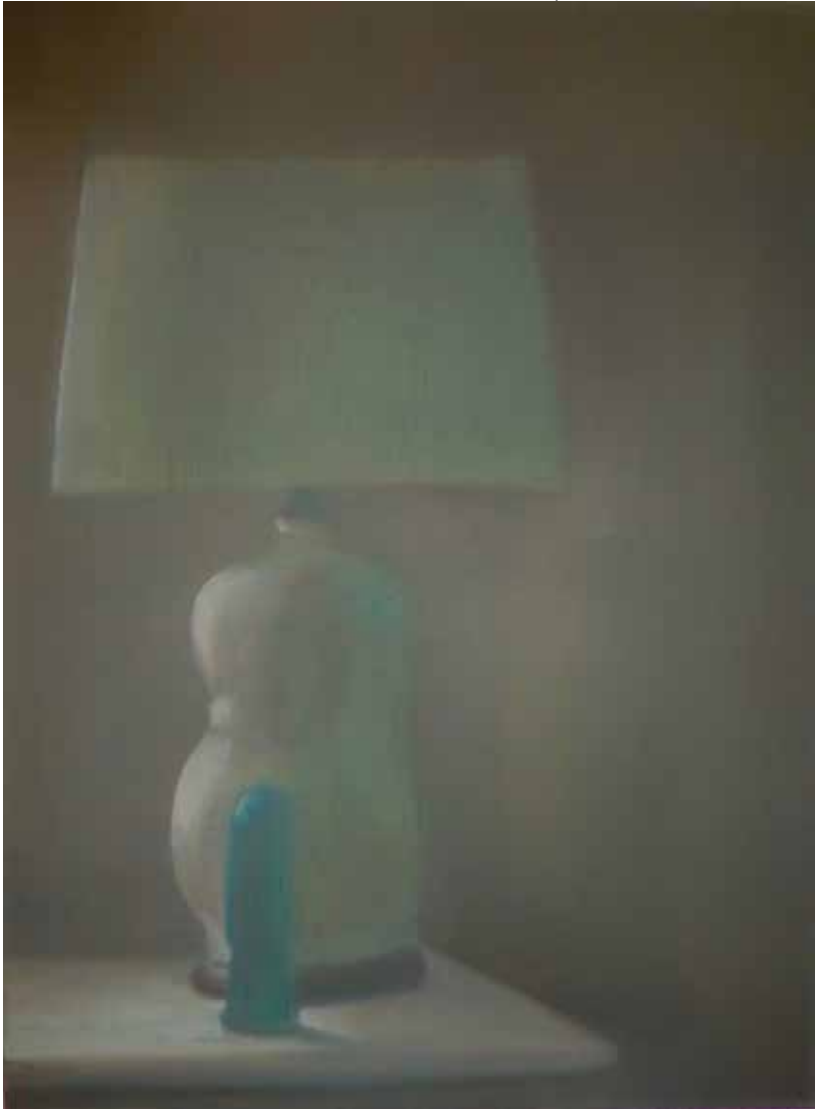
Vasilis Zografos Untitled, 2012 huile sur toile 80 x 60 cm