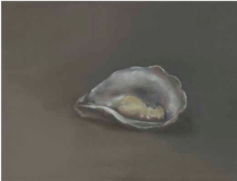
Vasilis Zografos Untitled, 2014 huile sur toile 20 x 25 cm