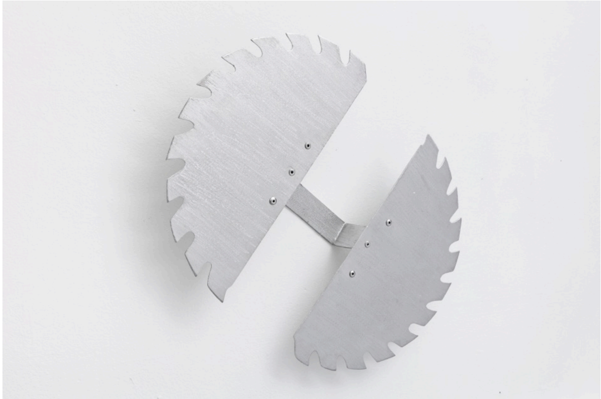
Alcinha Dentada (Bretelle Dentée), 2019