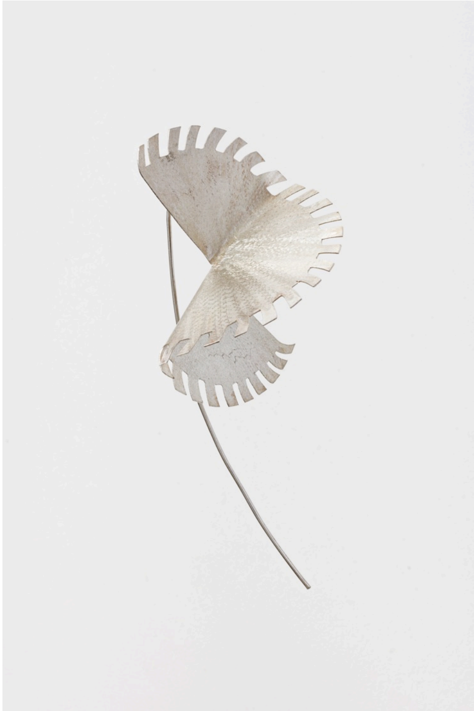
Brinco Bixinha Serrada (Boucle d'oreilles Bixinha dentée), 2019 Argent 925 4 x 4 x 9 cm