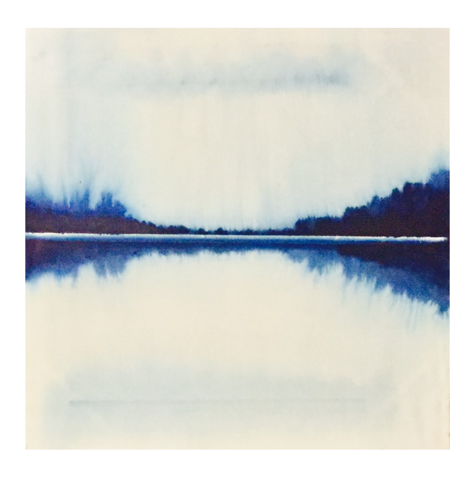
Blue Blur, 2016 Oil and acrylic on canvas 100 x 100 cm